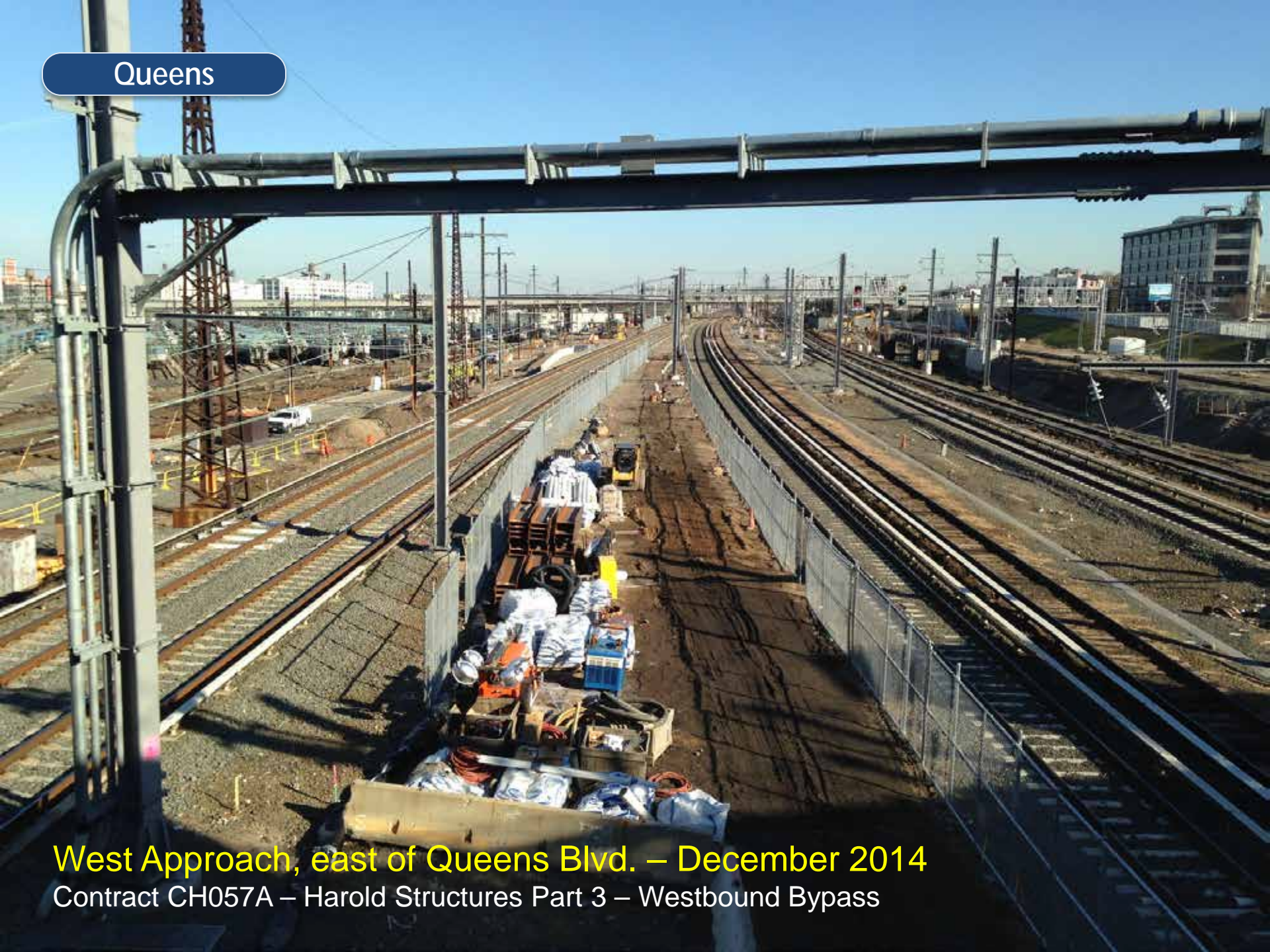
West Approach, east of Queens Blvd. – December 2014 Contract CH057A – Harold Structures Part 3 – Westbound Bypass